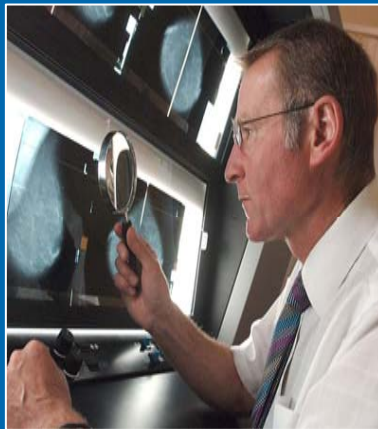
Breast Screening Early detection services