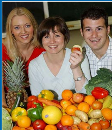
Lobbying, Campaigning, Education & Research